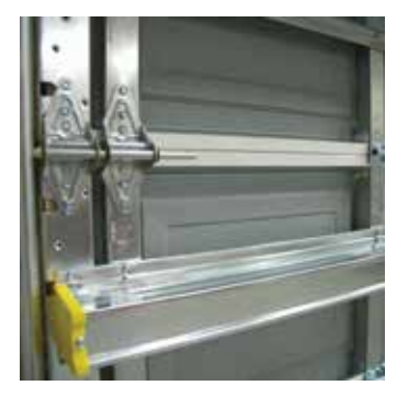
Single or double end stiles are provided depending on wind load specifications. Both feature Raynor's heavy-duty diamond hinges