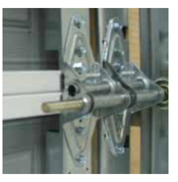
Raynor's high-strength rollers are designed and tested to withstand hurricane force winds.