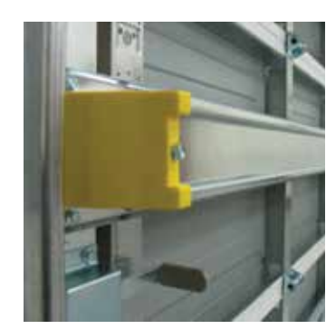
Raynor's patented box strut design features a yellow cap at each end for safety and visibility.