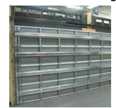
Raynor Hurricane Ready reinforcing systems utilize horizontal trussing, made from high-tensile steel box struts or u-bars, to create a door system built to withstand hurricane force winds.